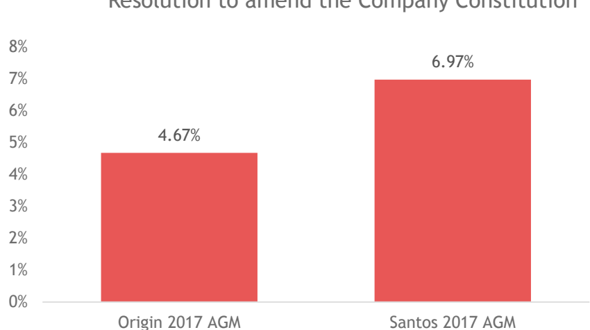
Resolution to amend the Company Constitution

The resolution requesting the change in the Company's constitution received only 4.67% of votes cast in favour. This is somewhat lower than the vote results for a similar resolution that was put forward by Market Forces at Santos' (ASX: STO) 2017 AGM earlier in the year, and which was similarly not supported by the Board.